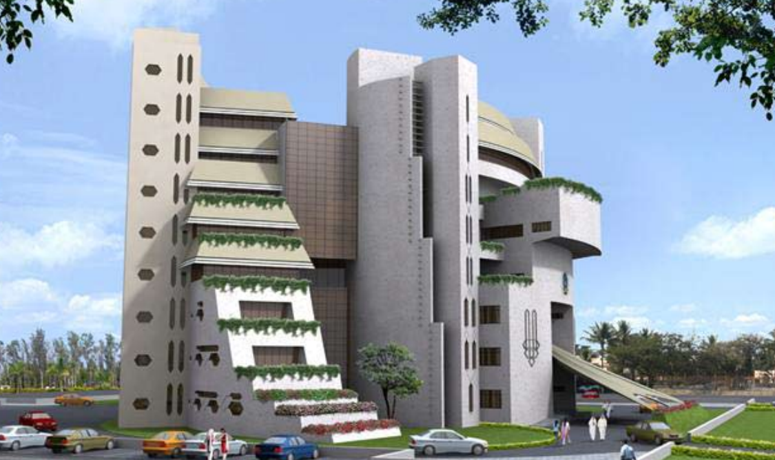
The brand new building of the RAK College and Hospital of Dental Sciences, ready to accommodate students and patients by September 2010.